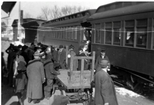
An image of a passenger train at the Contoocook Depot, c. 1940s.

Historical Society is once again taking part in a MUSE (MUseums Sharing Experiences) collaboration. "All Aboard! Economic, Social and Environmental Change During New Hampshire's Railroad Era" will look at the impact of the railroad on rural New Hampshire towns and Native American