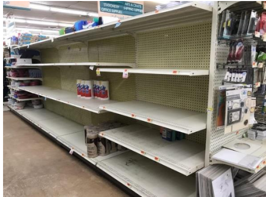
Photograph of the paper goods aisle at Colonial Village in Contoocook, N.H., March 22, 2020.

One hundred years from now, what would you like people to know about the COVID-19 Pandemic of 2020? Hopkinton Historical Society would like to document people's stories of what they are feeling, seeing, and/or doing during these unprecedented times. How has your daily scheduled changed? What are your fears? How long do you think we will have to physically distance ourselves from each other? How can we help others in our community? What acts of kindness have you seen? Please share your stories and photos by sending them to nhas@tds.net .